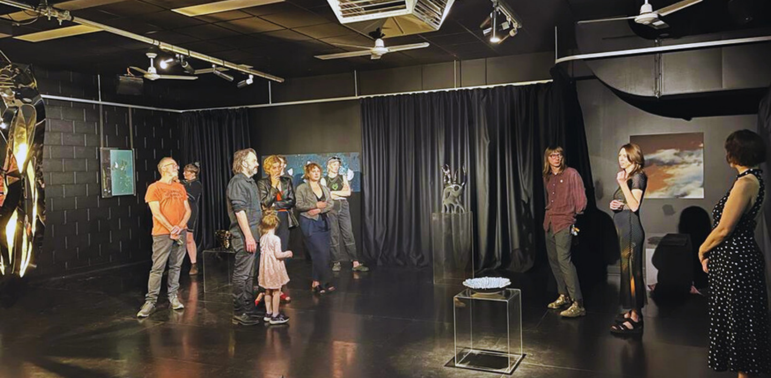
Image: Desert Festival 2023 exhibition opening for 'It takes longer than you think', a mixed media installation by Project Seed participants, Gretel Bull & Jaxon Waterhouse.